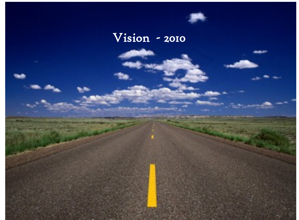
Vision - 2010

Paul writes to the church at Philippi and says whatever happens in life conduct yourselves in a manner worthy of the gospel of Christ. "Whatever happens" covers the widest possible range of setbacks: unemployment, ill health, loss of friends, disappointment in love, pressure of work, lack of appreciation, disloyalty and bereavement. Whatever happens prosperity and poverty, happiness and misery, victory and defeat, we are to conduct ourselves "worthy of the gospel of Christ."